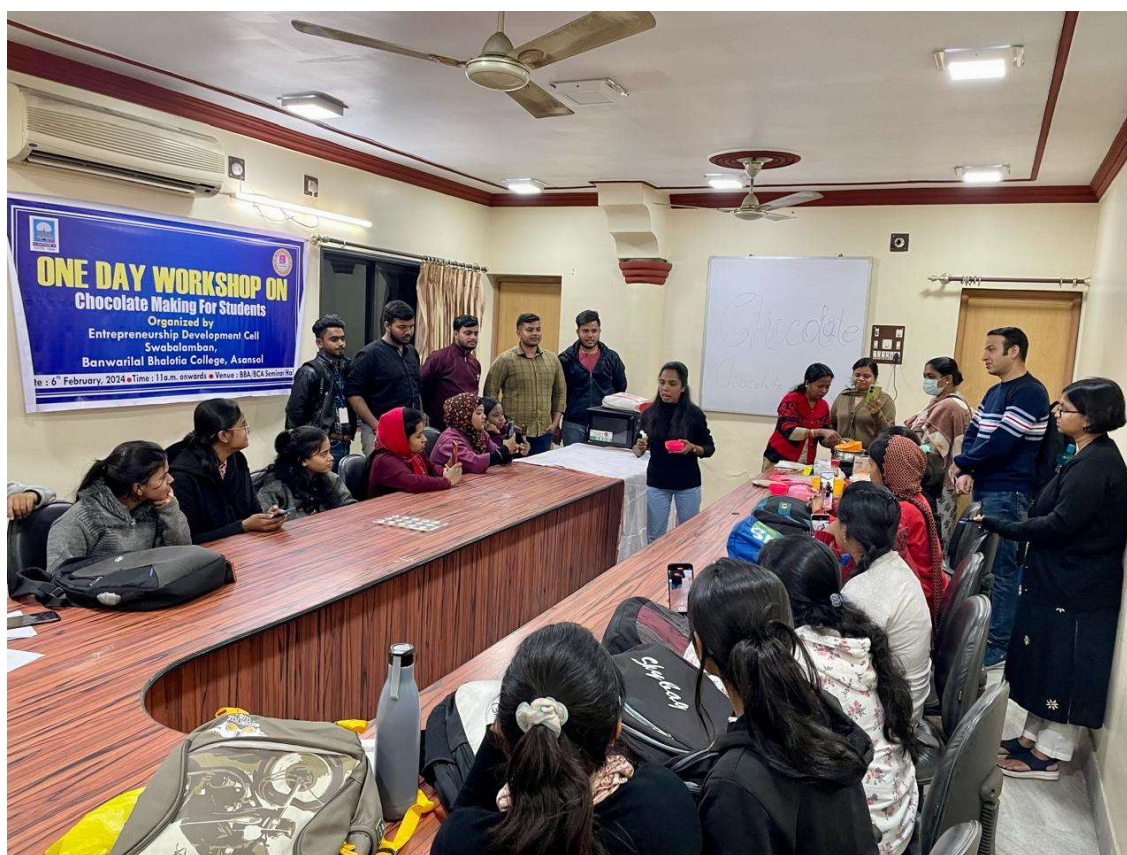
Students taking part in the workshop on Chocolate making